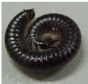
Fig. 2 – a Portuguese Millipede curled in a spiral

The Department of Agriculture (Western Australia), as the government agency responsible for horticultural and farming development, research, education, and pest and weed control, is investigating means of controlling the Portuguese millipede population in Perth. They are currently participating in research on the possibility of utilising biological control agents.