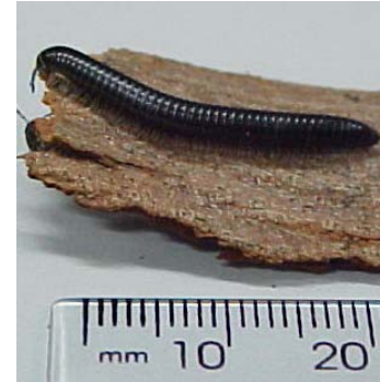
Fig. 1 – a single Portuguese millipede

Portuguese millipedes (fig. 1 right) are an introduced species of millipede, with a smooth cylindrical body, ranging in colour from black/grey to light brown. When disturbed, Portuguese millipedes commonly curl up into a tight spiral (fig. 2 below).