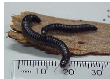
Fig. 3 – two Portuguese millipedes

While Portuguese millipedes do not pose a health or agricultural threat, are not harmful to humans, and have the benefit of assisting in the break down of garden litter into the soil, they cause a nuisance when they invade homes and buildings.